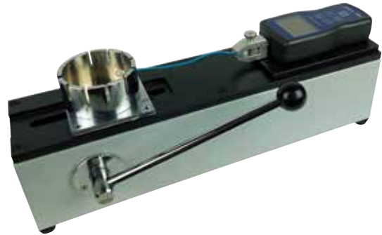
Shown with removal of left grip assembly. Installation of optional FG-WTG-X100L wire terminal turret and FG-M6FLCH16U force grip.