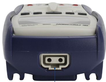
Optical isolated USB interface for PC connectivity