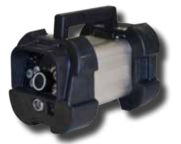
DT-3011J includes front & rear rubber guard protectors.

Application: Inspection and timing of shedding and weft running time