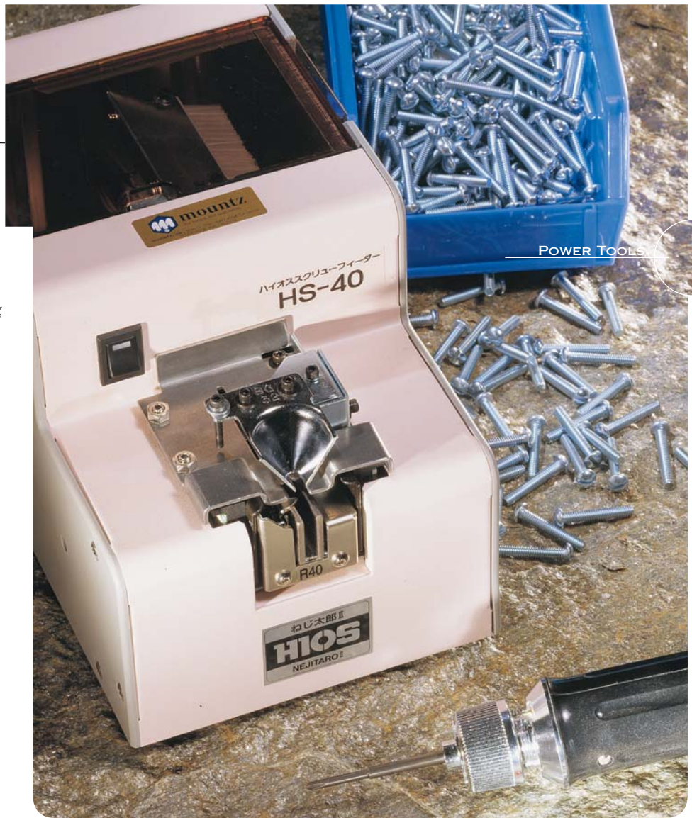
Table Top Screw Presenter with Changeable Rail Units