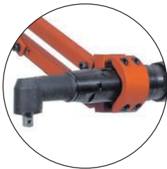
Angle Driver Clamp