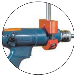
Pistol Grip Clamp