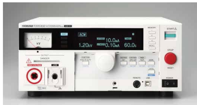
▲ View with the protection cover removed

In consideration of safety for the operator and the environment, the output terminal of HIGH-side has been placed in the most distant location from the control area. The free rotation mechanism protects from twisting (or breaking) of the cable. Also, with having the lock function for the LOW terminal on the main unit, the metal plate is no longer attached to the test lead of LOW-side, and it makes to resist damage to the test lead. Because of elimination of these projected components, the TOS5300 can avoid from unexpected accidents such as when the unit travels to other location. And also when the test lead is snagged on something, or unexpected stress is applied on the test lead, the High (High-voltage) test lead is designed to disconnect easily, but the Low (ground) test lead is designed to resist disconnection. In order to prevent the insertion error, the color coding of the cable are classified to HIGH (red) and LOW (black), and the plug shape of terminal are also different design.