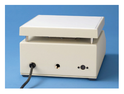
• Model HS70 (left)