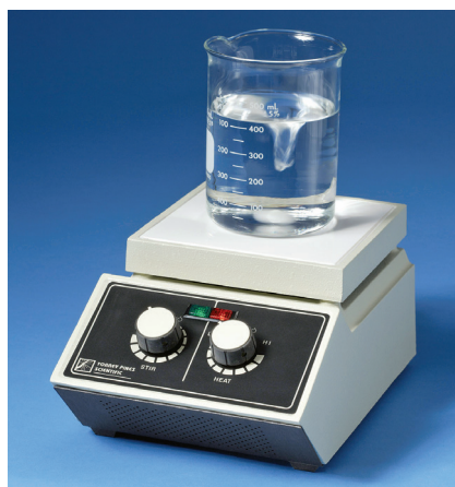
• Model HS1 (right) • Models HS11 and HS11A (left)