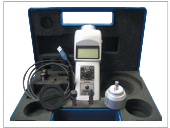
DT-209X shown in Carrying Case. 12" wheel FPM-12 & FPM-12CBL.