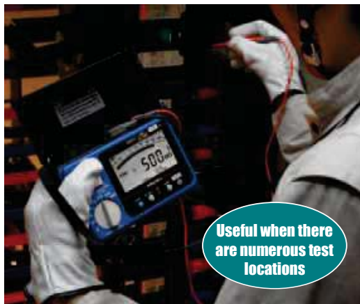
In some cases, the capacitance component may prevent a judgment from being made until charging completes.

The insulation testers deliver results as soon as the test lead makes contact, letting you finish your work rapidly similar to a continuity check.