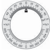
American & S.I. scales