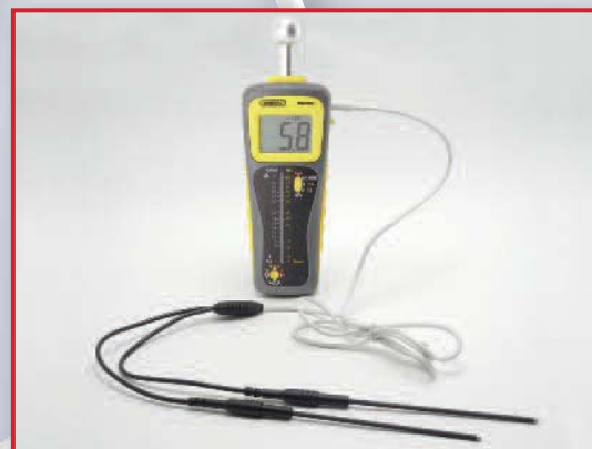
The MMD950 with the optional MP905 Deep Wall Moisture Probe