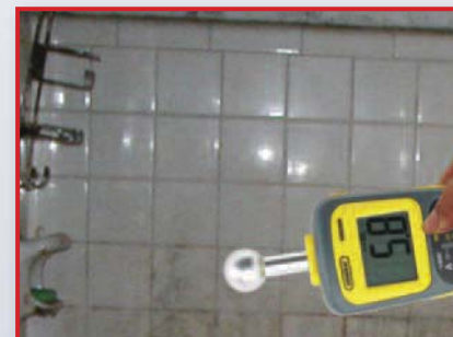
Locate moisture/water damage deep behind tiles