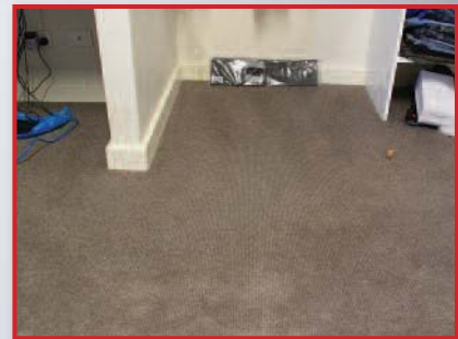
Check for moisture damage deep below carpet surface