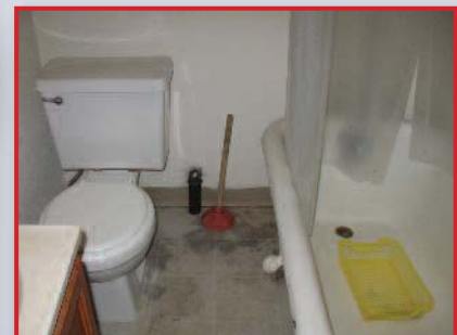
Locates moisture under bathroom floors