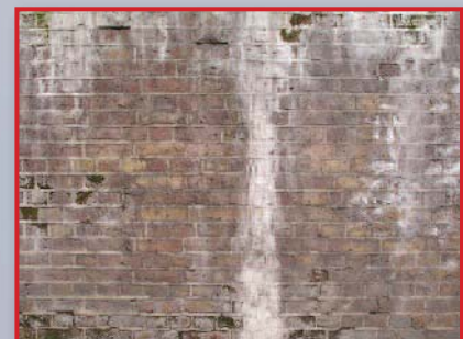
Check for moisture in masonry

8715 Mesa Point Terrace San Diego, CA 92154 Toll Free: 1.866.363.6634 Tel: 1.619.429.4545 Fax: 1.619.374.7012 Email: sales@calright.com http://www.calright.com