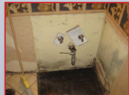
Locates moisture under bathroom vanities where mold thrives