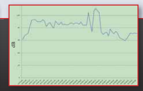
Typical Excel Plotted Data