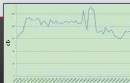
Typical Excel Plotted Data