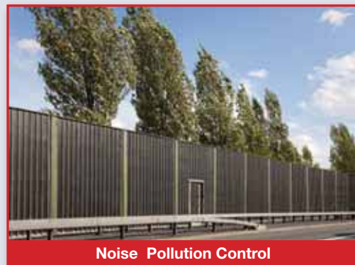
Noise Pollution Control