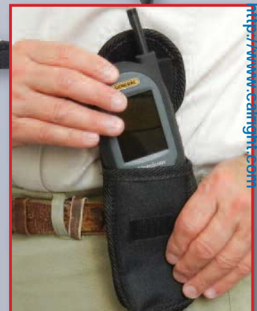
Handy pouch with belt clip

8715 Mesa Point Terrace San Diego, CA 92154 Toll Free: 1.866.363.6634 Tel: 1.619.429.4545 Fax: 1.619.374.7012 Email: sales@calright.com http://www.calright.com