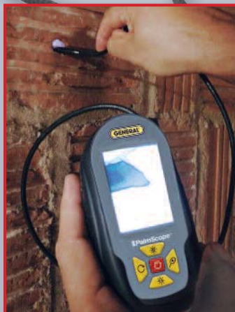
Look behind a wall through any small hole