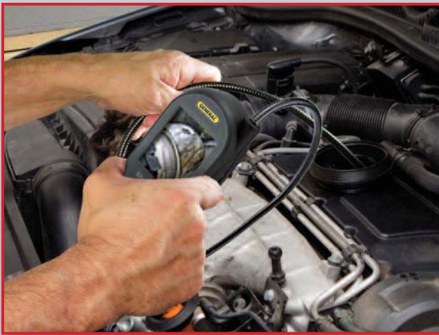
Perfect for crowded modern engine compartments

GENERAL TOOLS & INSTRUMENTS The Right Source For Your Test & Measurement Needs