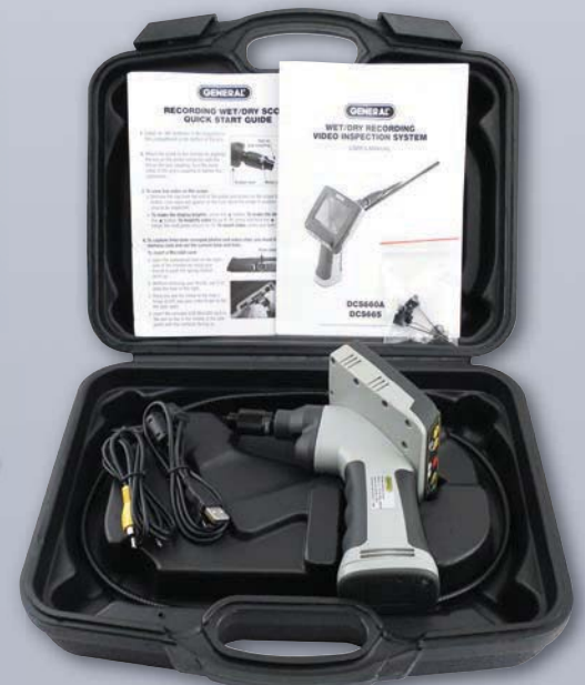
A packaged DCS660A system