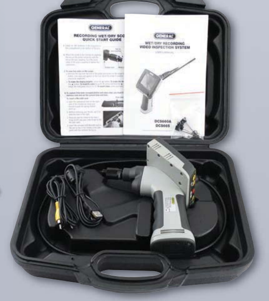
A packaged DCS660A system