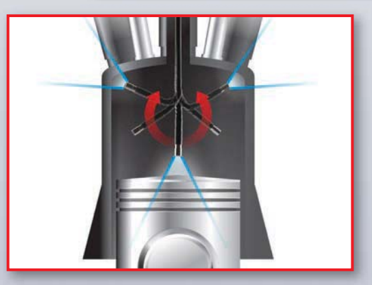
The 270° sweep of the articulating probe makes it possible to view areas "behind" the probe tip