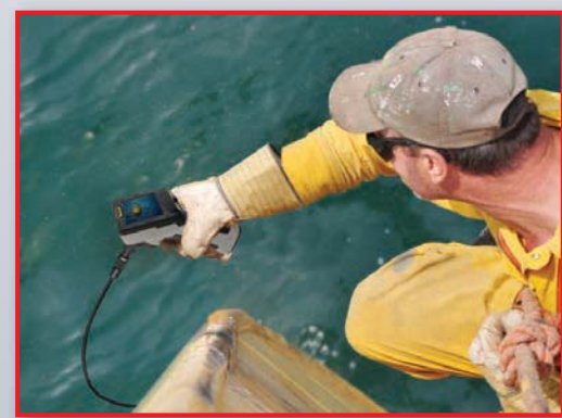
Makes underwater inspections possible