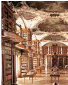
Museums, art galleries

The HygroPalm2-series (with integrated or interchangeable probes) is ideal for all applications where exact measurement of humidity and temperature is of decisive importance, e.g. the food and pharmaceutical industries, printing and paper industries, many trades, the sciences, meteorology, agricultural sector, climatology, etc. There is hardly a field today in which these parameters may be ignored. It is ultimately the measuring task at hand that defines the HygroPalm instrument that best meets your needs.