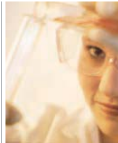
Healthcare, the sciences