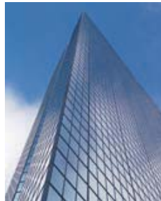
HVAC / Building management