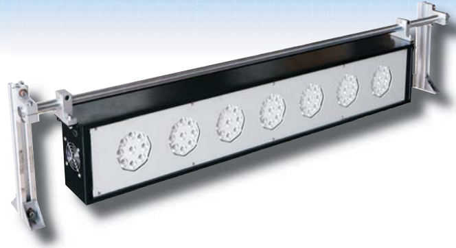
ST-329BL-4 LED Array shown with Optional Mounting Kit

The ST-329BL is designed for speed and frequency measurements in the printing, packaging, textile, automotive, cable, medical industries in various applications.