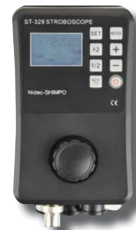
ST-329 Operation Control Enclosure