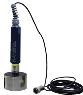
Customized Electric LVDT Sensor ordered separately.