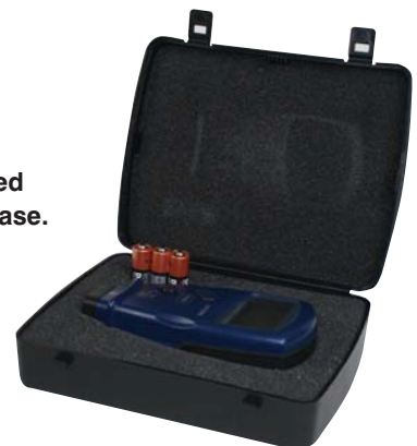
PT-110 with included protective carrying case.