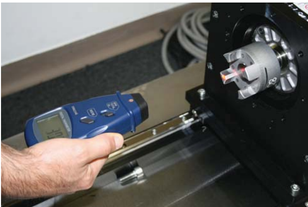
PT-110 recording rotational speed of machinery.