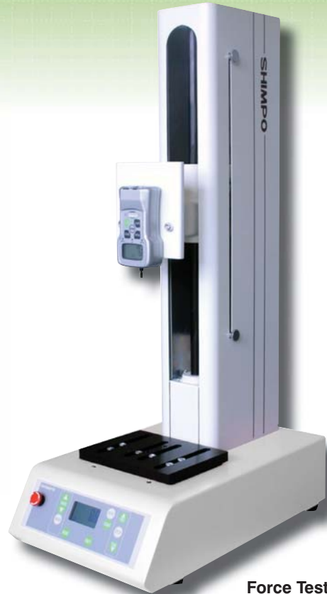
Force Test Stand shown with Force Gauge (Sold Separately)

The FGS-VC's can be equipped with various gripping and compression fixtures and are compatible with all Shimpo Force Gauges as well as most gauges on the market. These features make the new FGS-VC the ideal push/pull tester for the production line or QC lab.