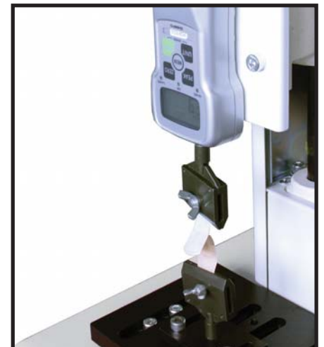
Stand with Optional Grip Performing Peel Test