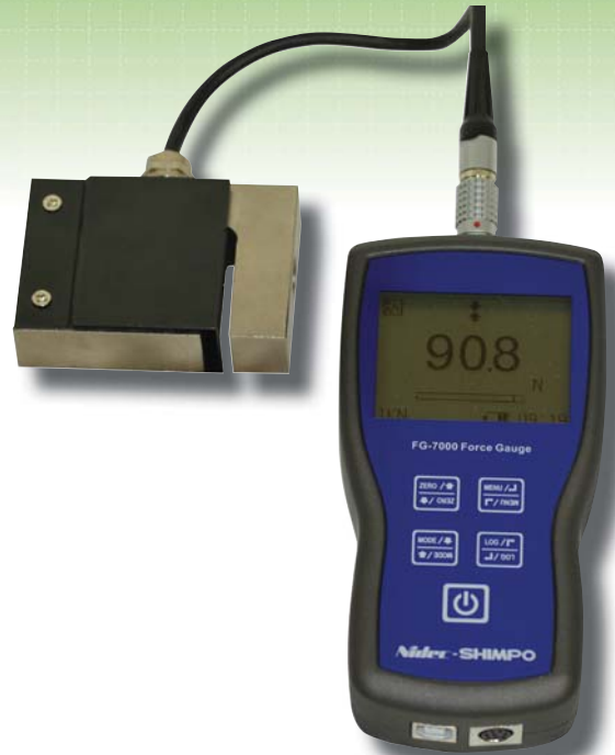
FG-7000L with Connected Load Cell