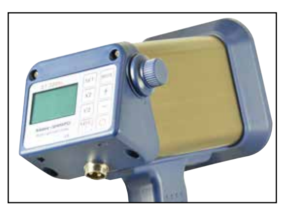
Operation Panel & Flash Adjustment Dial