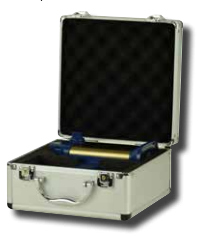
ST-320BL in Included Metal Carrying Case