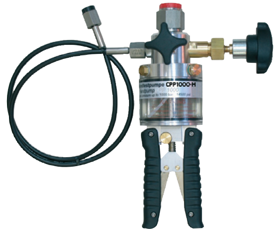
Hand test pump model CPP1000-H