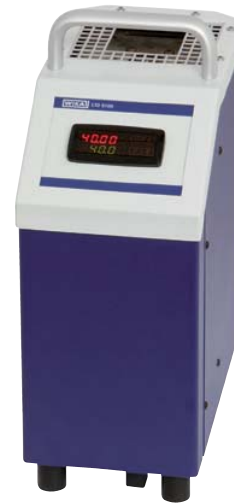
Temperature dry-well calibrator CTD9100-650