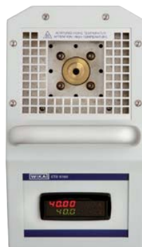
Temperature dry-well calibrator model CTD9100-650

The CTD9100-450 is used in the medium temperature range up to 450 °C. It generates its temperature with resistive electrical heating and features an enlarged insert with Ø 60 mm. Thus, it is possible to calibrate several temperature probes simultaneously without the need of changing the insert.