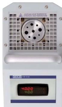
Temperature dry-well calibrator model CTD9100-450

These calibrators operate using Peltier elements and, as a result, can achieve testing temperatures below the ambient temperature. Due to their capacity for active cooling, they are often used in the biotechnology, pharmaceutical and food industries. The CTD9100-165-X features an enlarged insert with Ø 60 mm. Thus, it is possible to calibrate several temperature probes simultaneously without the need of changing the insert.