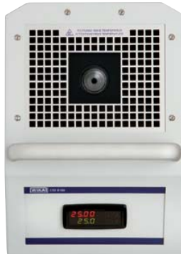
Temperature dry-well calibrator model CTD9100-165 or model CTD9100-COOL

Four instruments for the temperature range from -55 ... +650 °C