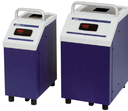
Temperature dry-well calibrators model CTD9100