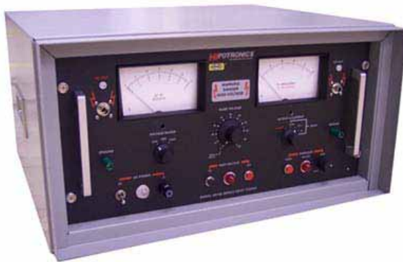
HD100 Series AC/DC Hipot Tester

The AC/DC output configuration eliminates the need for purchasing separate AC and DC hipots. Output connected voltmeter ensures accurate voltage measurements regardless of output loading. They are capable of testing to most industry specifications such as UL, CSA, VDE, IEC, and MIL for dielectric withstand testing.