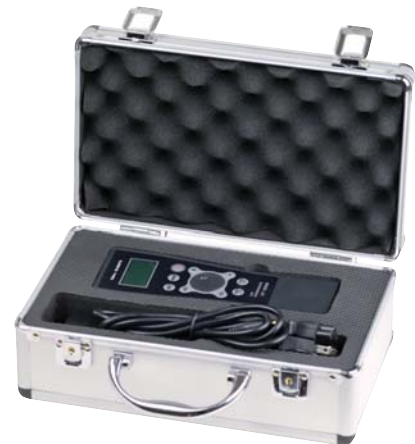
DT-326B in Included Protective Carry Case.