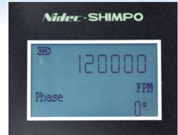
LED Panel Display Close-up