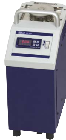
Micro calibration bath model CTB9100-225