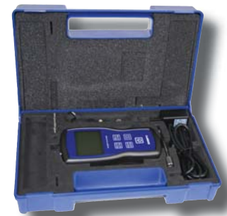
FG-7000 with Accessories in Protective Carrying Case