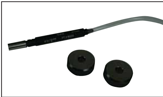
Customized Air Probe Sensor with Maximum & Minimum Calibration Masters. Ordered separately.