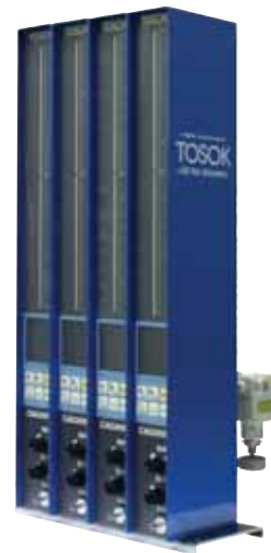
CAG-2000 Shown Stacked in Multiple Columns