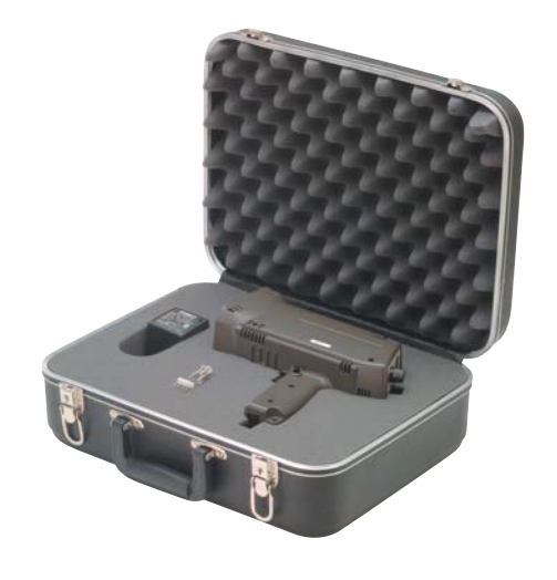
DT-725KIT Includes Protective Carrying case, spare flash tube and Battery Charger