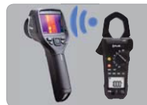
Bluetooth® METERLINK® Communication