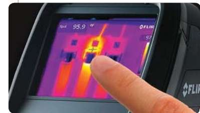
Large 3.5" Touchscreen