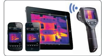
FLIR Tools Mobile Wi-Fi Connectivity