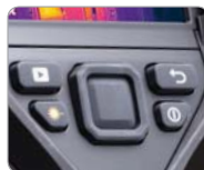
Large Buttons for Easy Glove-Handed Operation