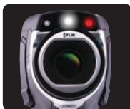
Visible Light Pictures Align with Thermal Images: 3.1MP Digital Camera, LED Lamp, and Laser Pointer