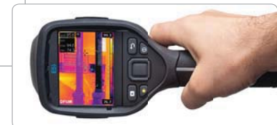
Auto-Orientation Keeps Diagnostics Overlays Upright