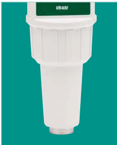
Magnetic base included