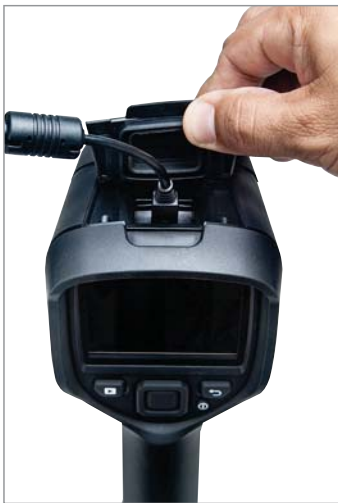
Download images fast via USB

Specifications are subject to change without notice. For the most up-to-date specifications, go to www.flir.com