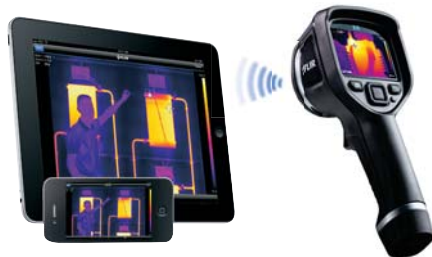
Wireless Connectivity to Smartphones, Tablets and more.

PORTLAND Corporate Headquarters FLIR Systems, Inc. 27700 SW Parkway Ave. Wilsonville, OR 97070 PH: +1 866.477.3687