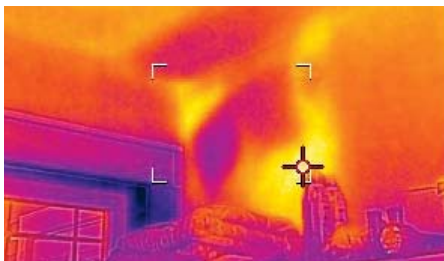
See temperature patterns showing insulation voids and other building issues