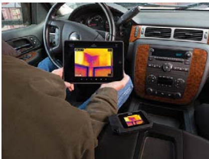
Upload images to FLIR Tools over Wi-Fi