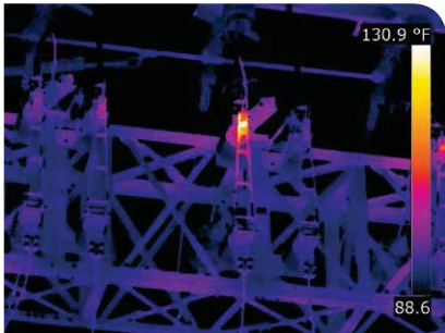
Overheating substation circuit breaker