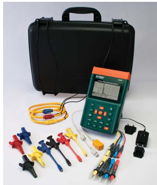
Includes (3) flexible current clamps, (4) voltage leads with alligator clips and retractable plunger clips, 8 AA batteries, universal AC adaptor, software, USB interface cable, and case