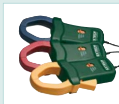
Model PQ3120 1000A Current Clamp Probes with 2.2" (55mm) jaw opening

1200A (12"/304mm) or 3000A (24"/609mm) Flexible Current Clamp Probes for wrapping around busbars