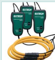
Model PQ3220 (3000A) Model PQ3210 (1200A)

Choose the best clamp probes to fit your application needs ranging from 100A to 3000A and flexible vs traditional jaw type.