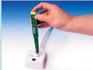
Voltage check in an outlet