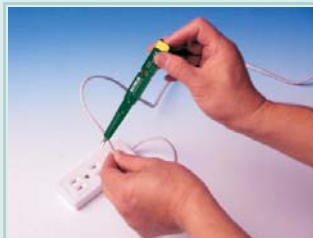
Checking for open wires in cables