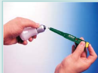
Light Bulb Continuity Check