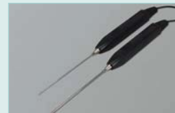
881603 and 881604 immersion probes