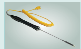
881602 surface probe