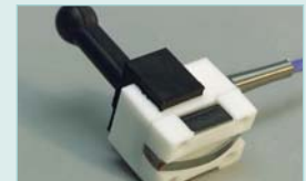
881616 surface probe