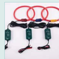
Model PQ34-30 3000A (24"/600mm) Flexible Current Clamp Probes for wrapping around busbars