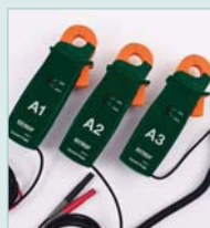
Model PQ34-2 200A Current Clamp Probes with 0.8" (19mm) jaw opening

Choose the best clamp probes to fit your application needs ranging from 200A to 3000A and flexible vs traditional jaw type.