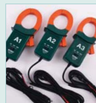
Model PQ34-12 1200A Current Clamp Probes with 2" (50mm) jaw opening