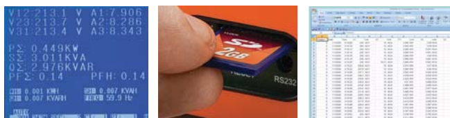
Backlit LCD displays numerical values. The data can be stored in SD memory card (included) and then transferred from meter to PC using Excel ® software and datalogged readings.