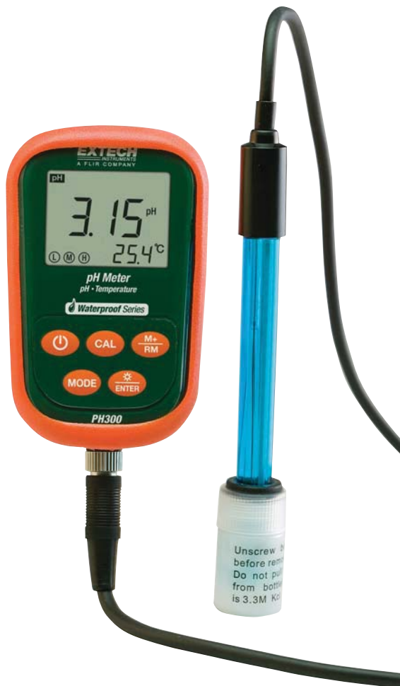
Large blue backlit dual LCD display with calibration and memory indicators