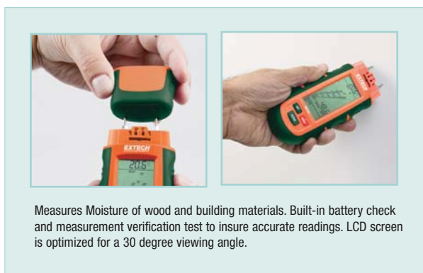
Measures Moisture of wood and building materials. Built-in battery check and measurement verification test to insure accurate readings. LCD screen is optimized for a 30 degree viewing angle.