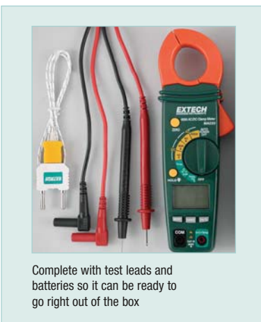
Complete with test leads and batteries so it can be ready to go right out of the box