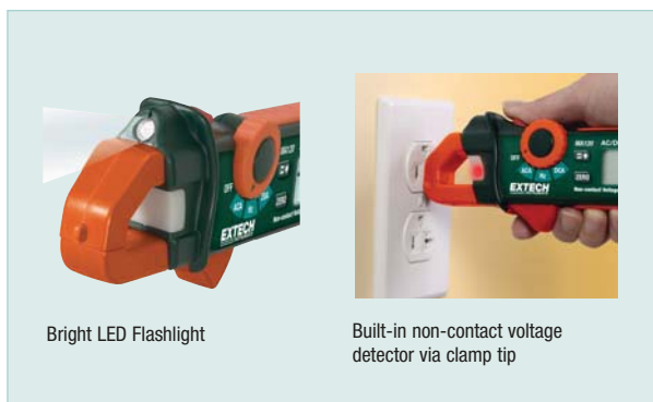
Bright LED Flashlight