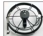
Camera probes with cable length greater than 3m will be coiled on a spool as shown on the left.