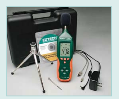
Meter and accessories are packaged in a rugged hard carrying case for added protection