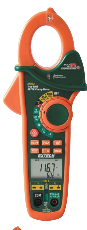
Built-in IR Thermometer for quick and safe non-contact temperature measurements.