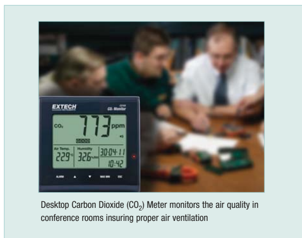
Desktop Carbon Dioxide (CO 2 ) Meter monitors the air quality in conference rooms insuring proper air ventilation