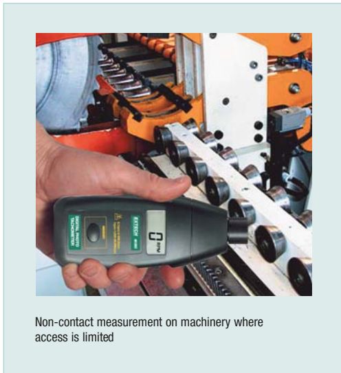
Non-contact measurement on machinery where access is limited